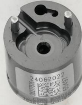
Custom Valve Body ( single groove)