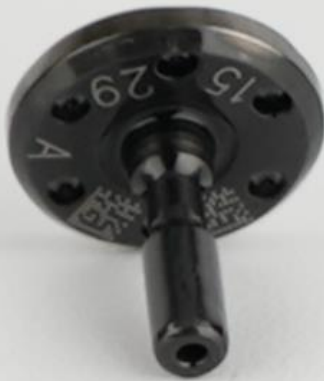
Custom Valve Core ( black color with coating)