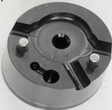
Custom Valve Body ( three grooves)