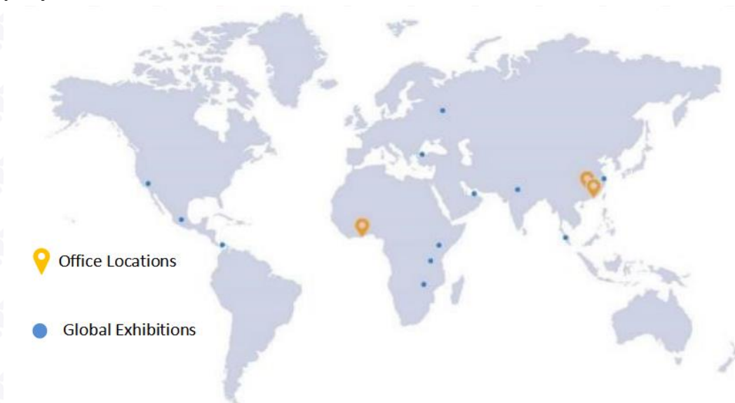
Pic No. 18

▲ The unpacked injector control valve must be rust-proof during secondary storage.