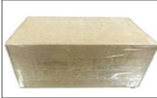
Pic No. 16

Domestic express packaging: Wrapped by Transparent tape