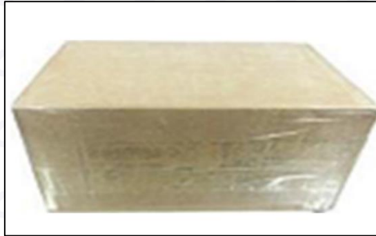
Pic No. 16

Domestic express packaging: Wrapped by Transparent tape