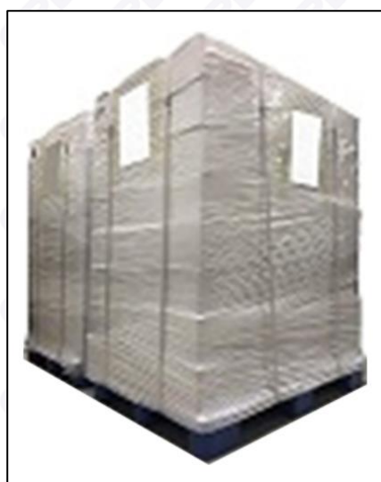
Pic No. 18

International express packaging: Wrapped with yellow tape after wrapping black protective film