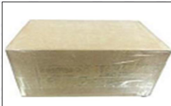
Pic No. 16

⚠ Minors are prohibited from using transparent tape, yellow tape, black wrapping protective film, and white wrapping protective film to avoid personal injury.