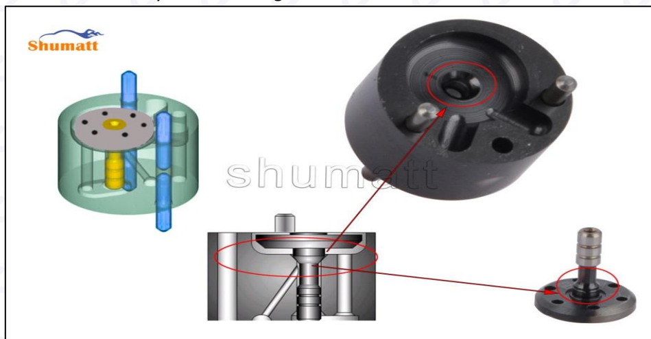
Pic No. 14

(1) Check and see if there is fray on the sealing surface of control valve and the control valve core.