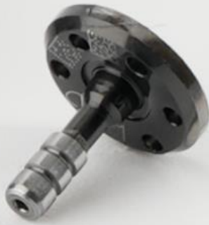
Custom Valve Core (white color with two grooves)