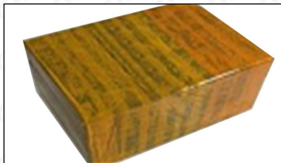
Pic No. 17

Domestic express packaging: Wrapped by Transparent tape