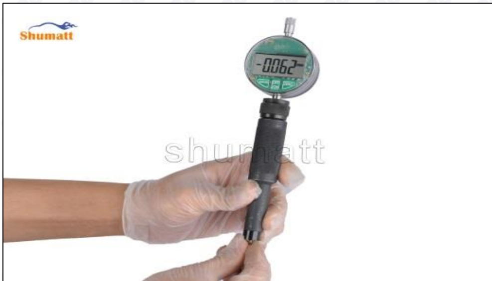
Pic No. 15

lift of the armature will affect the fuel injection quantity at each point. The greater the armature lift, the greater the fuel injection volume, if the armature stroke is out of range, please replace control valve in time.