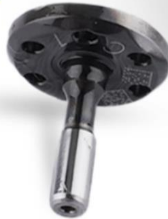
Custom Valve Core (white color without coating)