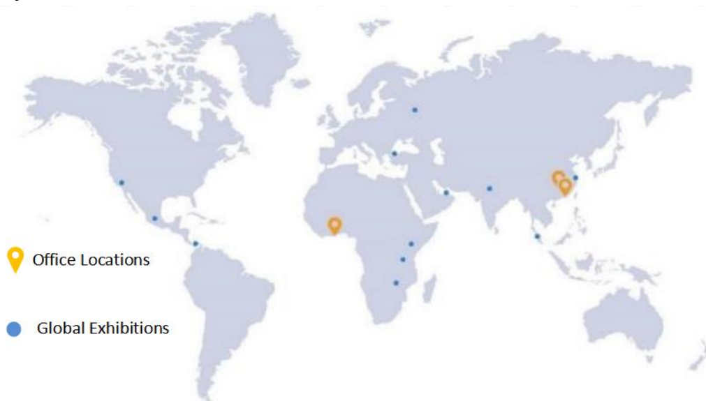
Pic No. 18

▲ The unpacked injector control valve must be rust-proof during secondary storage.